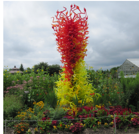
One of the Dale Chihuly glass sculptures incorporated into the gardens at the Frederick Meijer Gardebe and Sculpture Park in Grand Rapids, MI in a special exhibit that runs through September 30th. Definitely worth the trip!

I am forwarding the white paper I’ve prepared on this strategy along with the newsletters this month. If you have the appetite for it, please give it a read. You’ll note that one of the conclusions I reach is that the strategy has implications for fund selection, particularly for equity funds. As I’ve not had the opportunity to screen funds with the new strategy in mind, portfolio positions have been re-established using index funds. In order justify using actively-managed funds, with their attendant higher costs, I must satisfy myself that the active funds perform better during times when the strategy would require the category to be invested. In other words, a fund’s performance in adverse markets will be less important than if we intended to remain invested in declining as well as advancing markets.